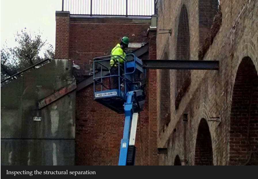
Inspecting the structural separation

Preserving a façade or key structural components intact isn't always a practical option, but that doesn't mean that elements of a structure can't be saved! A recent project of ours included salvaging stone from a historic clock tower so it could be rebuilt as a monument adjacent to the new construction.