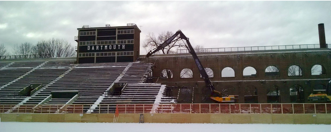
A Volvo 460 High Reach Excavator approaches the press box